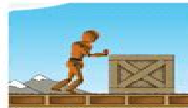
Sam pushing and box moving