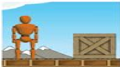
Sam not pushing